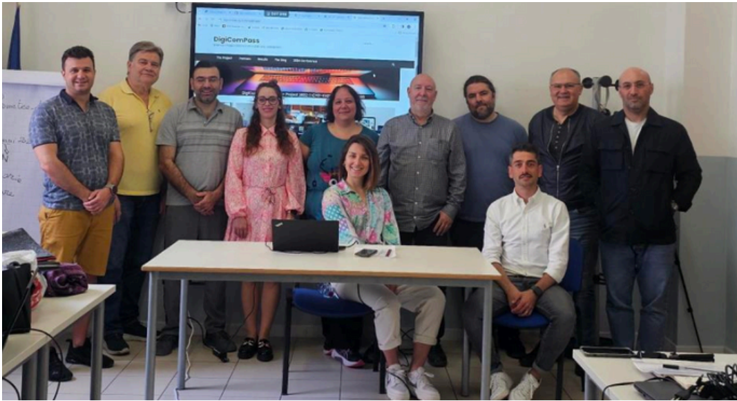
Transnational project meeting in Trani (Italy) Apr. 2024 - Set up pilot test.

This association will be presented more extensively during the upcoming conference to be organized at the University of Cyprus, the project's lead institution: