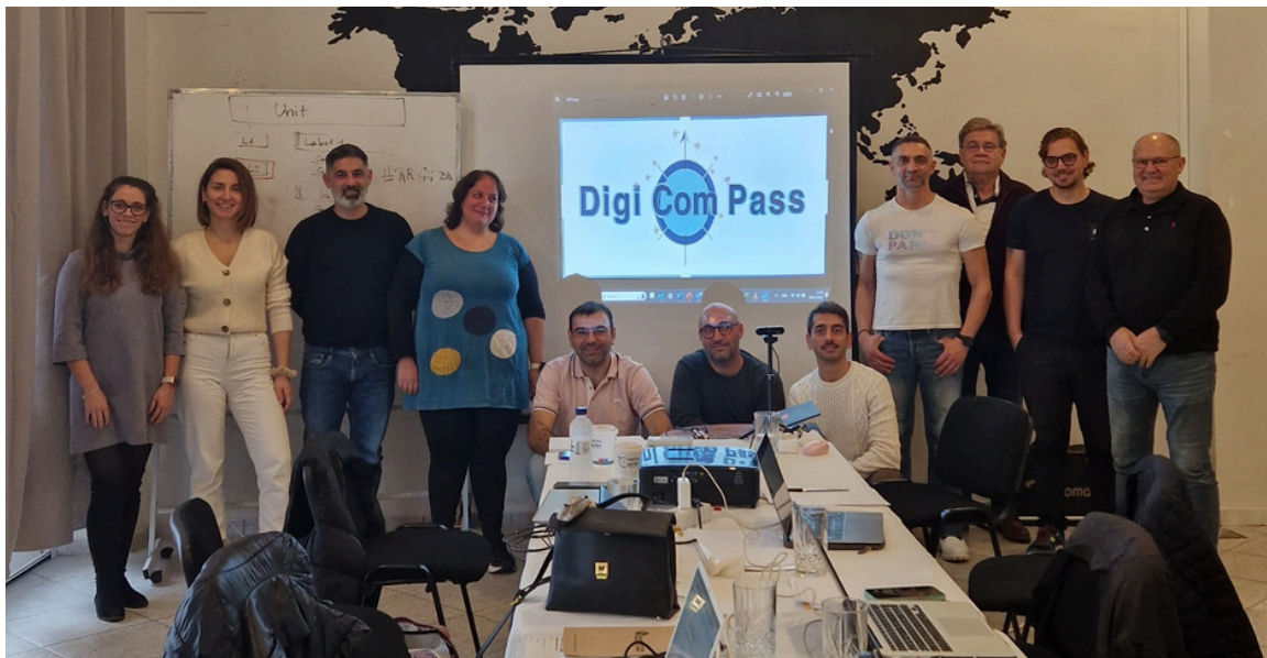
Project meeting in Kalamata (Greece) Nov. 2023 – Multimedia Creation Training

The newly formed consortium is developing a digital skills curriculum and certification using the Flipped Learning 3.0 approach. The curriculum is designed for different target groups, including adults, unemployed youth, students, students with special educational needs and immigrants. The aim is to develop a pathway that is adaptable to multiple target groups, while being inclusive and accessible, given the diverse nature of the audience.